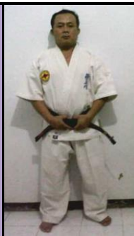
*** PAIMUN DAN III DOJO GADING SERPONG KABID PEMBINAAN