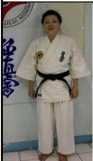
** MARIA TAN DAN II DOJO St. ANTONIUS