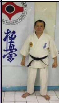
** THE SIU HWA DAN II DOJO GADING SERPONG