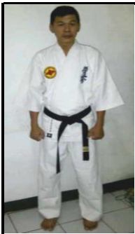
*** KEKONG DAN III DOJO BSD PIMDA BANTEN