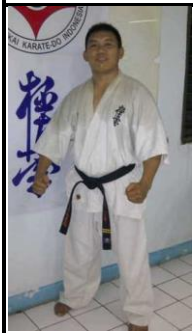
*** ZULMIE DAN III DOJO PAHOA