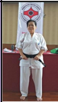
*** RITA SUGANDA DAN III DOJO St. ANTONIUS